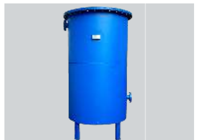
Acetylene Low Pressure Drier