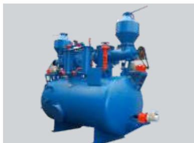
Acetylene Plant GENERATOR