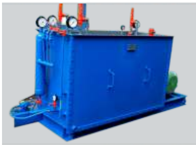
Acetylene Plant Compressor