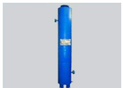
Acetylene Plant Cooler Condense