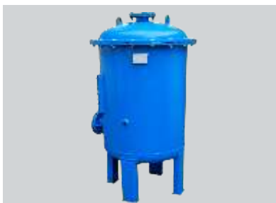
Acetylene Plant Ammonia Scurbe