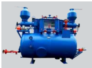
Acetylene Plant Generator