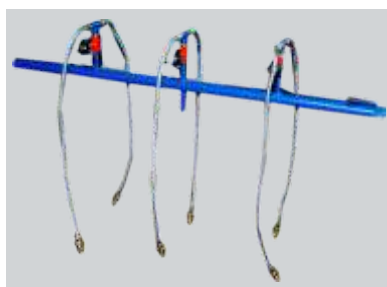
Acetone Plant Back Mani folds