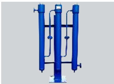
Acetylene Plant High Pressure .Drier