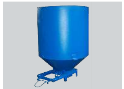
Acetylene Plan Carbide Hopper